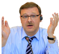
IPU Vice-President Mr. K. Kosachev (Russian Federation)