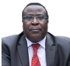
IPU Vice-President Mr. E. Ethuro (Kenya)